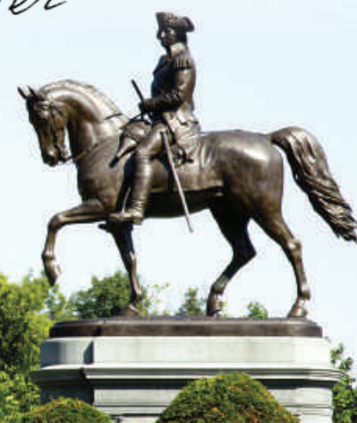
PHOTO: George Washington Statue in Boston Public Garden